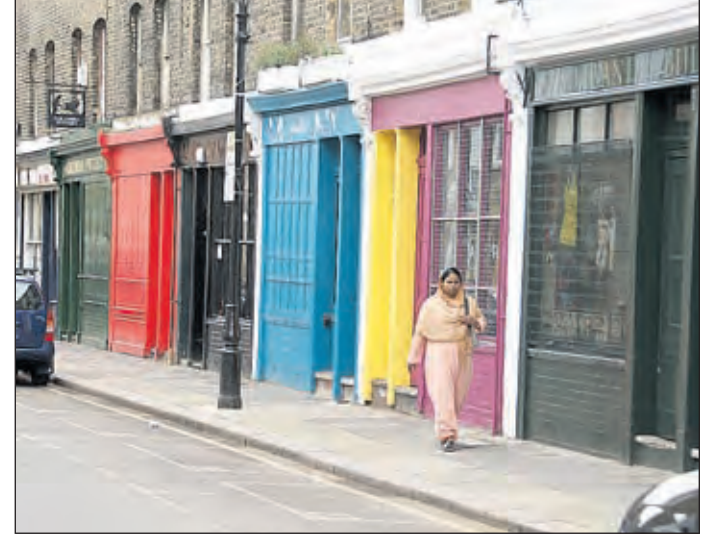
A rainbow of shuttered shops on Columbia Road